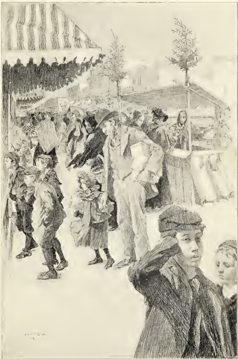
CHRISTMAS SHOPPERS IN AVENUE A.